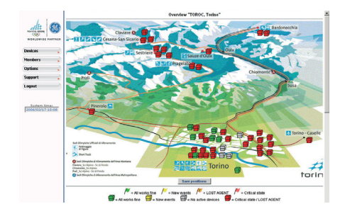
Graphical status overview